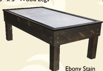
Ebony Stain 5" x 5" Wood Legs