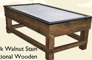
Dark Walnut Stain Optional Wooden Cross Brace 5" x 5" Wood Legs