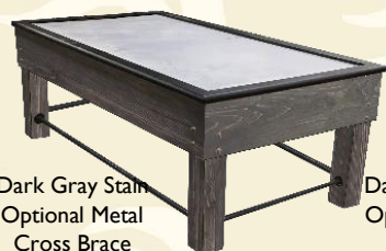
Dark Gray Stain Optional Metal Cross Brace 5" x 5" Wood Legs