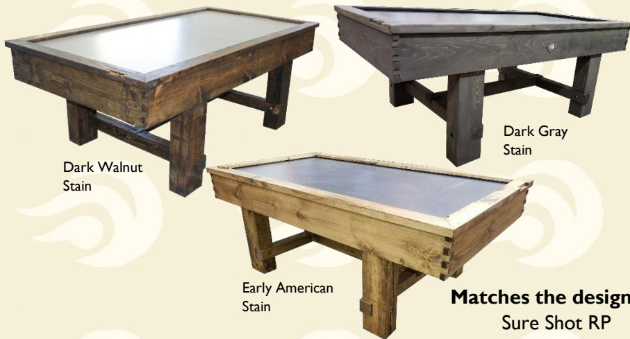
Dark Walnut Stain